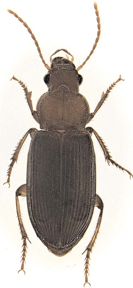
Fig. 1. Ophonus puncticeps .