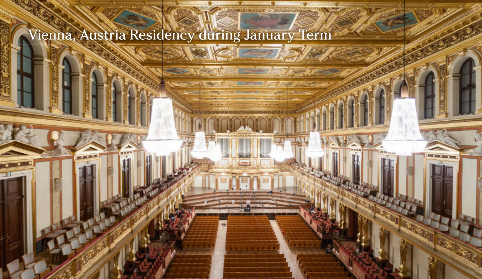
The Symphony Orchestra's culminating performance was at Vienna's famed Musikverein.

Vienna, Austria, is a city of exquisite architecture, major art museums, storied coffee houses, and, of course, world-class orchestras. Known as “The City of Music,” it’s where Beethoven, Mozart, Haydn, Strauss, and Schubert lived, and where 10,000 people continue to take in live classical music each night. And it was where 86 Luther students lived, practiced, and performed for three weeks in January 2019, just as Luther musicians have every four years since 1977.